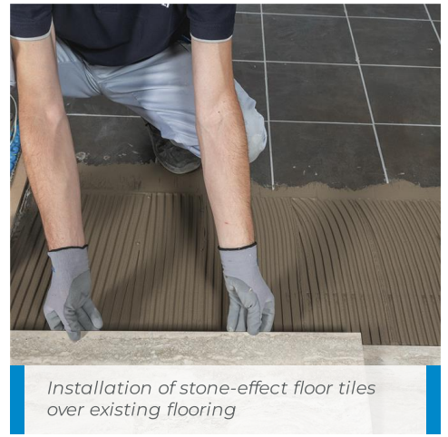
Installation of stone-effect floor tiles over existing flooring