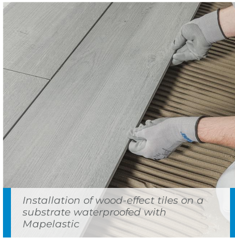
Installation of wood-effect tiles on a substrate waterproofed with Mapelastic