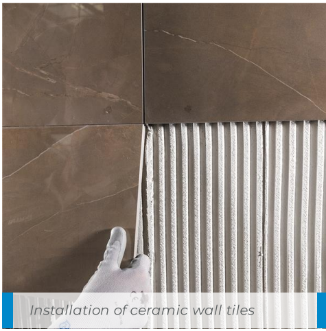
Installation of ceramic wall tiles